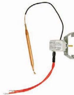
Unit Mount 52AT91