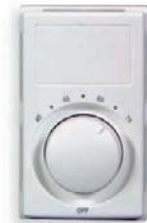
Wall Mount 2YU89