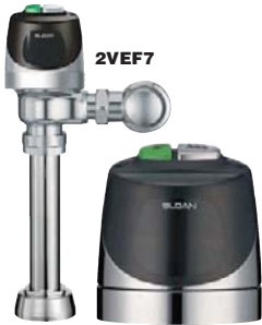
Dual Flush Retrofit Kit 2VEF9

For information on standards, go to Grainger.com.