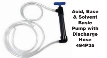
Acid, Base & Solvent Basic Pump with Discharge Hose 494P35