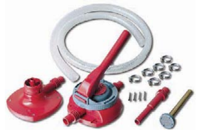
Automotive Fluids, Fuel & Oil, Basic Pump with Discharge Hose 4AYD5

* ABS = acrylonitrile butadiene styrene, AL = aluminum, BR = brass, EPDM = ethylene propylene diene monomer rubber, N = nylon, NBR = nitrile butadiene rubber, NR = nitrile rubber, NRB = nitrile Buna-N rubber, PE = polyethylene, POM = acetal, PP = polypropylene, PPGP = polypropylene co-polymer, PPS = polyphenylene sulfide, PT = polyacetal, PTFE = polytetrafluoroethylene, PVC = polyvinyl chloride, PVDF = polyvinylidene fluoride, S = steel, SS = stainless steel, TP = thermoplastic polyurethane.