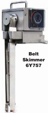
Belt Skimmer 6Y757