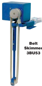
Belt Skimmer 3BU53