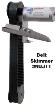
Belt Skimmer 29UJ11