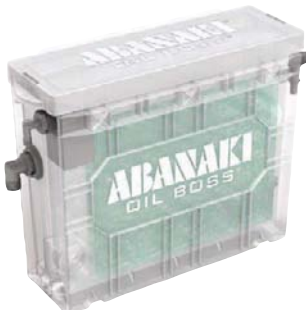
Magnet-Mount Skimmer 45AP79