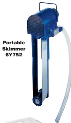
Portable Skimmer 6Y752