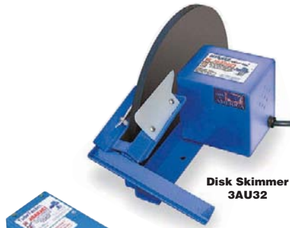
Disk Skimmer 3AU32