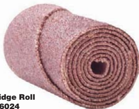
Cartridge Roll H6024