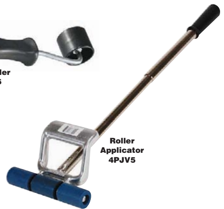
Roller Applicator 4PJV5