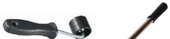
Hand Roller 55FD16