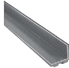
EZ Angle Concrete Embedment