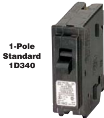
1-Pole Standard 1D340