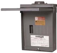
NEMA 3R 1D520