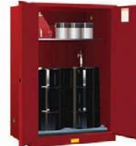
Vertical for 30 Gal Drums 786V90 (Contents not included.)