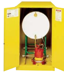
Horizontal for 55 Gal Drum 1YNF2 and Cradle 1BC80 (Sold separately; Contents not included.)