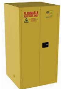
Vertical for 55 Gal Drum 8E868