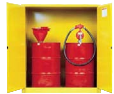
Vertical with Rollers for 55 Gal Drums K3029 (Contents not included.)