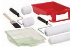
Brush, Roller & Tray Kits 48WL94