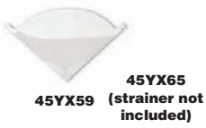
45YX65 45YX59 (strainer not included)