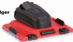
Paint & Stain Edger 12G323

Paint & Stain Edgers create clean, straight lines of paint along molding and trim without using painter's tape. These tools use disposable pads to spread paint alongside areas that are not intended for paint. They provide better control and less splatter than paint brushes, making them faster to use when cutting edges around ceilings, windows, doors, and in corners. Refill Pads replace old, worn pads to help ensure smooth, even paint coverage.