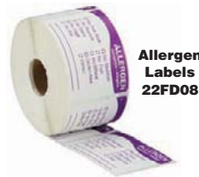
Allergen Labels 22FD08