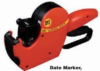
Date Marker, 1-Line 6GUU4